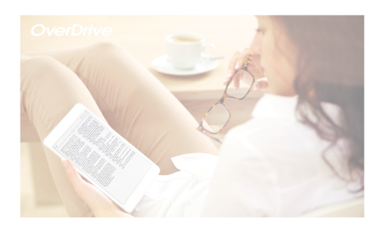
Borrow ebooks & audiobooks from Mohawk Community Library

Mohawk Community Library is excited to offer patrons a break from the cold winter months by visiting the library and treating yourself to a good book! Beginning on Monday, February 3, patrons of all ages can stop by the library to register for the 2025 winter program. There will be no better time to get cozy indoors by participating in fun activities, attending programs, and reading books for chances to win sweet prizes! The Mohawk Community Library Winter Reading Program will run from Monday, February 3 to Saturday, March 1.